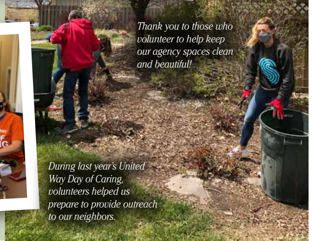
During last year's United Way Day of Caring, volunteers helped us prepare to provide outreach to our neighbors.