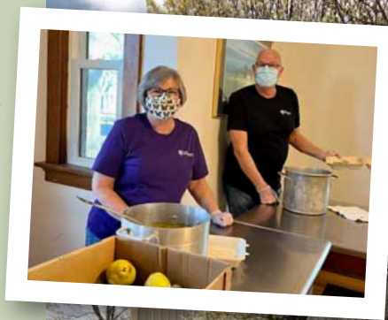
Every night at the Gathering Place, volunteers serve hot meals to our guests.