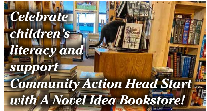
If you had fun looking for Charlie in this photo, consider purchasing a "Where's Charlie?" flip-book from A Novel Idea Bookstore in May! All proceeds will benefit Community Action Head Start.