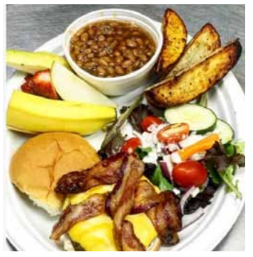
One of the 2020 goals for the Gathering Place is to increase the nutritional value of meals by including more fresh content.