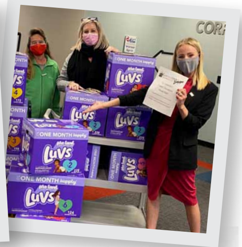
(Above) Thank you to Custom Blinds & Design! They donate one diaper for every blind sold, and selected us as a recent donation recipient!