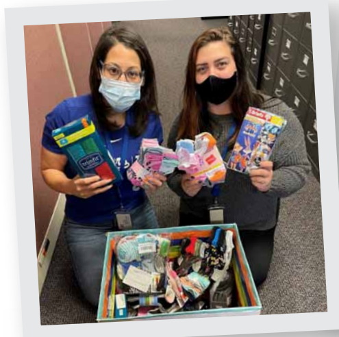
(Above) The Doane University Master of Arts in Counseling program collected over 200 pairs of socks and underwear for participants in our Supportive Housing Program!

Your kindness goes further than you could ever know!