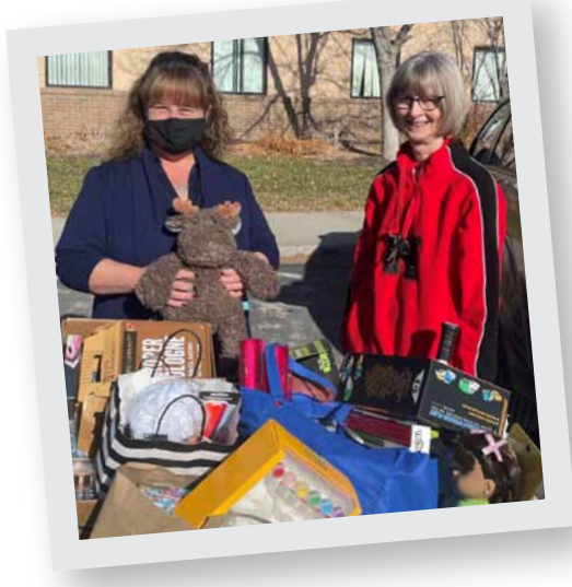
(Left and right) Our friends at Molex and the University of Nebraska Federal Credit Union, as well as others, collected hundreds of toys for the children and families we serve.