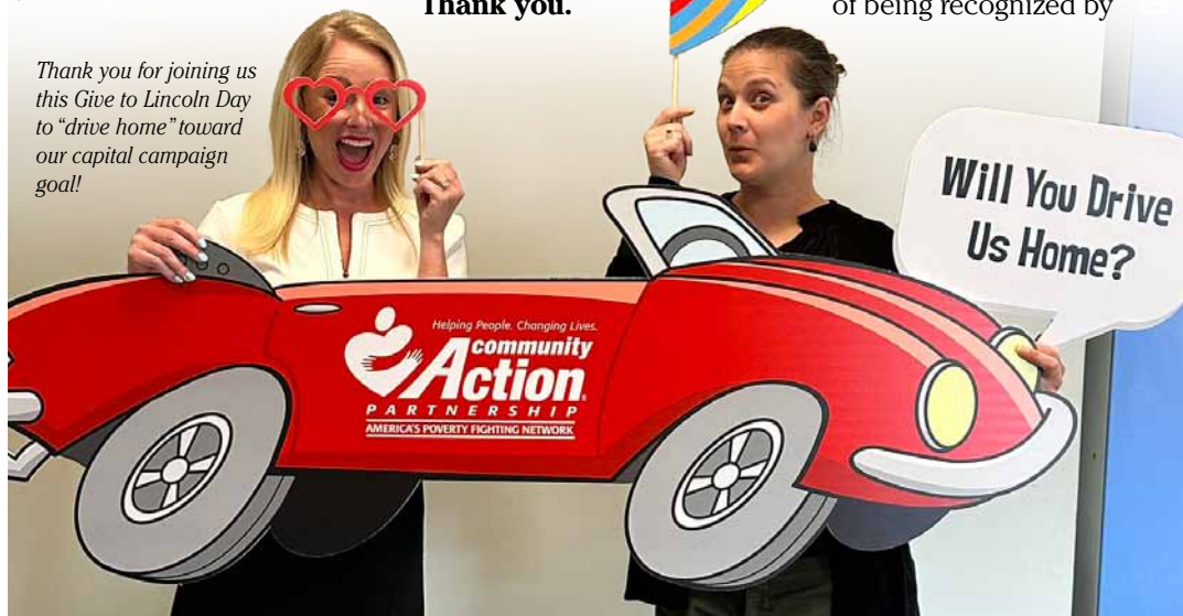
Thank you for joining us this Give to Lincoln Day to "drive home" toward our capital campaign goal!