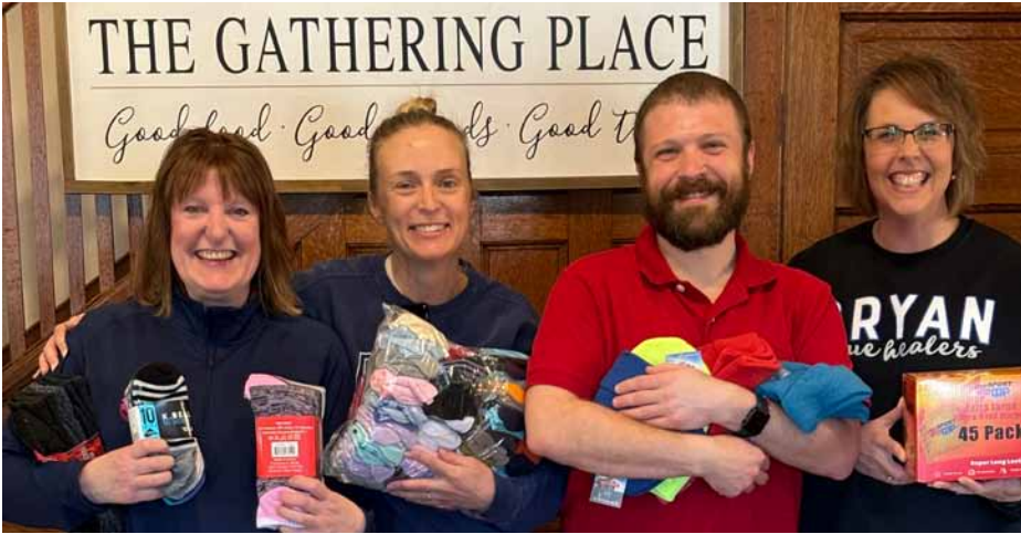
Thank you to our countless friends like the Alpha Alpha Zeta Chapter of Sigma Theta Tau nursing sorority for collecting warm clothing items for our Gathering Place guests!