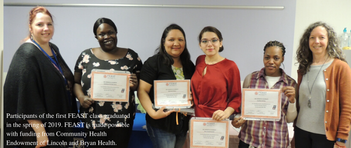
Participants of the first FEAST class graduated in the spring of 2019. FEAST is made possible with funding from Community Health Endowment of Lincoln and Bryan Health.