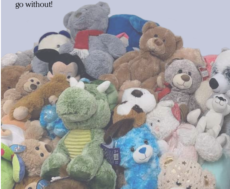
Last year, our friends from the Tint Shop donated dozens of items to the children served by our programs. Thank you, Tint Shop!