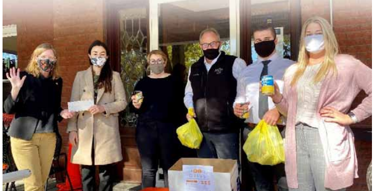
Thank you to our friends at Atwood, Holsten, Brown, Deaver, & Spier Law Firm who surprised us with a donation drive for the Gathering Place!

P.S. Gifts to the Gathering Place continue to be matched $1 for $1, thanks to our generous sponsors! If you'd like to give, visit www.communityactionatwork.org or mail your contribution to Community Action.