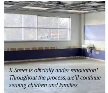
K Street is officially under renovation! Throughout the process, we'll continue serving children and families.

Thanks to much generous community support, we are nearly 60% of the way to our $4.5 million goal to support this renovation effort. But we need your help to drive us home. If you've