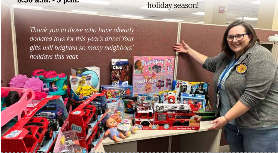
Thank you to those who have already donated toys for this year's drive! Your gifts will brighten so many neighbors' holidays this year.

Every donation to our holiday toy drive will help to brighten a child's winter holiday season. Thank you for considering spreading some extra love, warmth, and joy this holiday season!