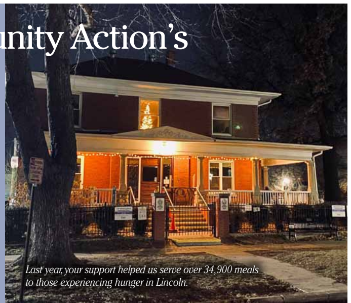
Last year, your support helped us serve over 34,900 meals to those experiencing hunger in Lincoln.

We can't do this without you. Thank you.