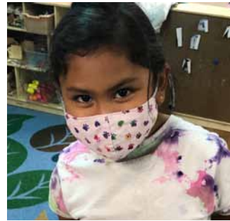
So much can change in five years! This August, we said farewell and congratulations to the first group of babies to attend our new Lincoln centers. They're off to do great things in kindergarten and beyond!

Thanks to your generosity, hundreds of our youngest neighbors have access to opportunities to succeed.